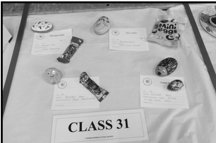
Spring Show - Children's classes.