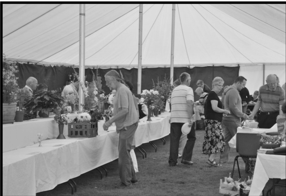
Show competitors staging their exhibits.