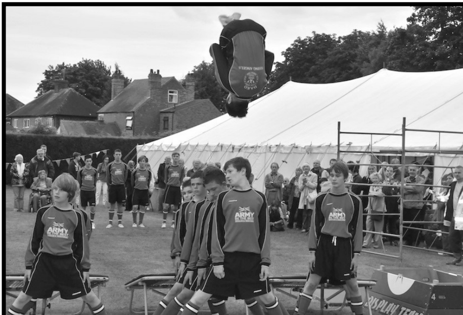
The Dako Flying Angels.