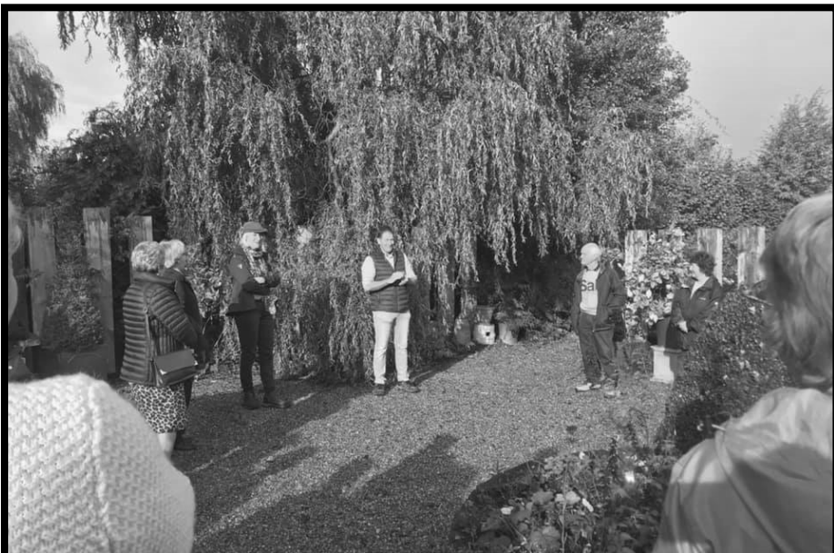
Trip to Floral Media.