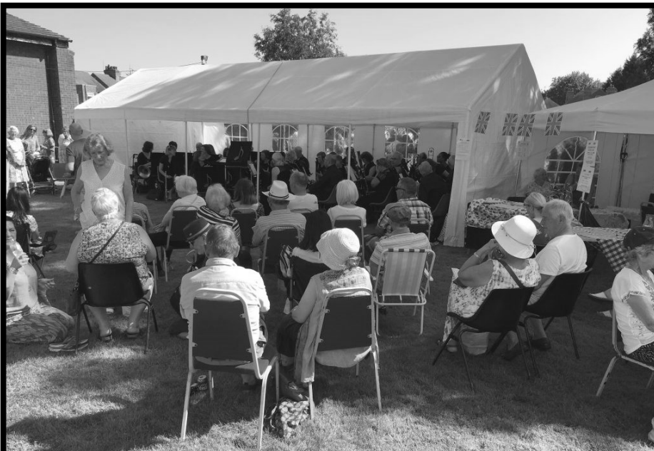
Enjoying the band at our Summer Show.