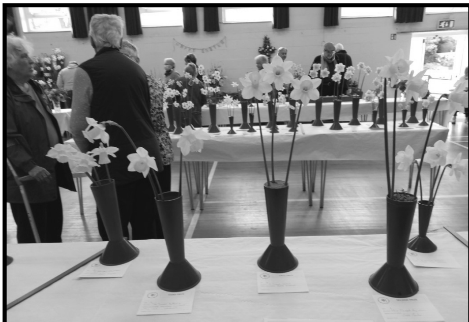
Daffodil entries at our Spring Show.