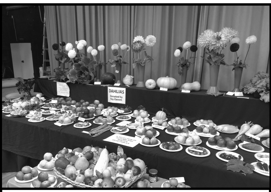
An amazing display at our Autumn Festival.