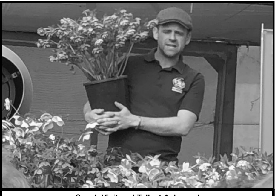
Coach Visit and Talk at Ashwood