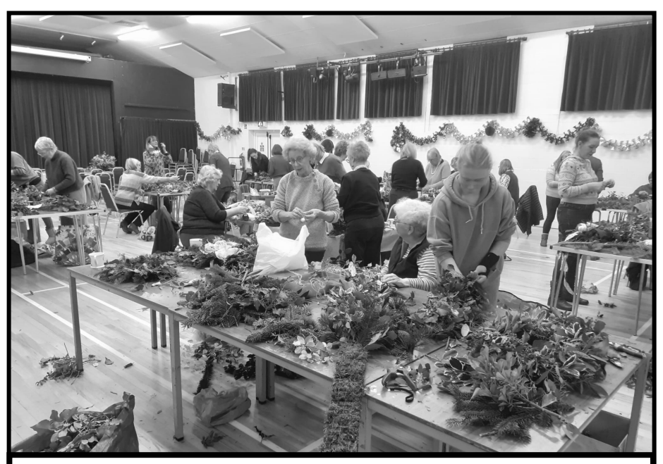
Lots of people busy creating at our Christmas Workshop