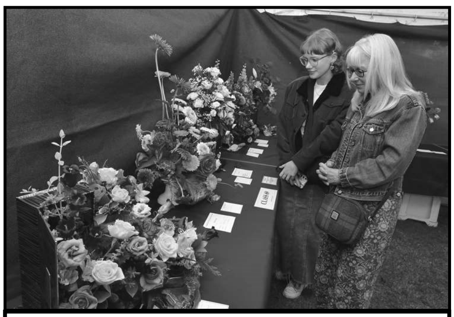
Flower Arranging Classes at Last Year's Summer Show