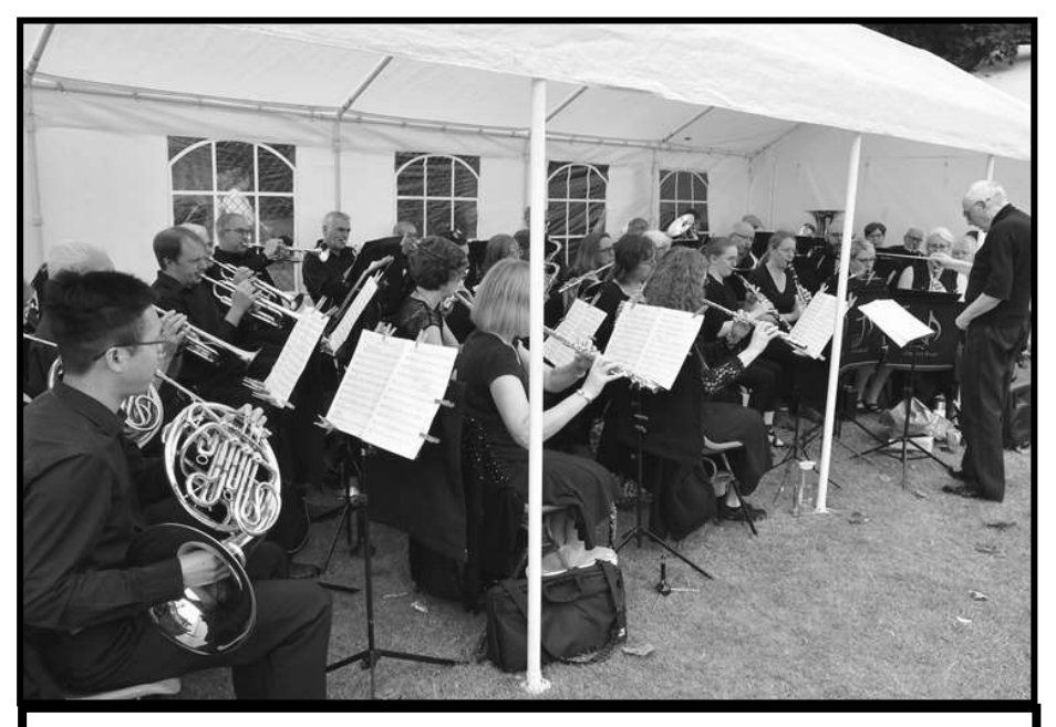
The Band at Last Year's Summer Show