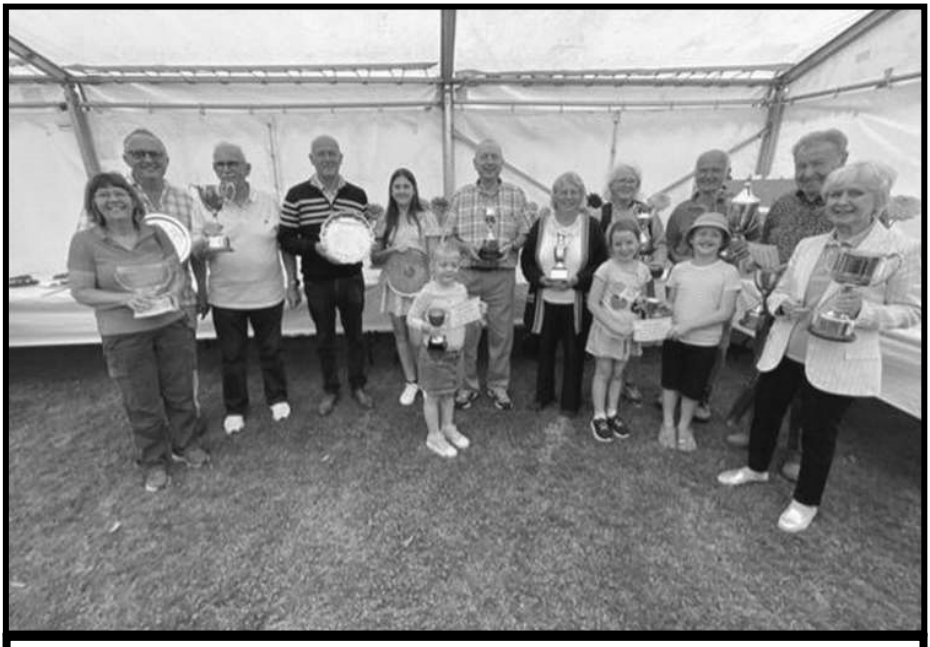
2024 Summer Show Trophy Winners