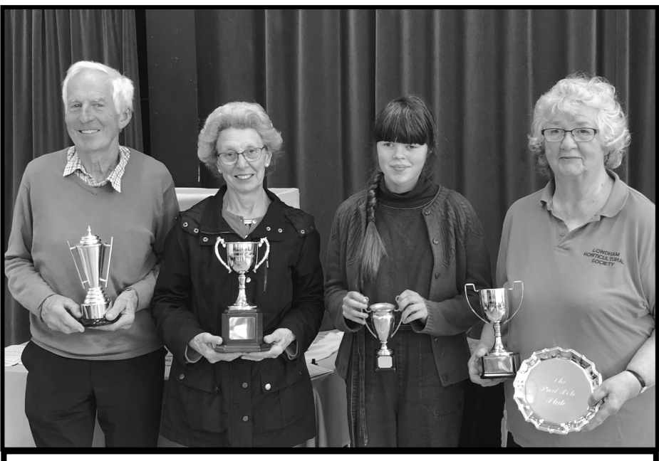
Spring Show Winners 2024